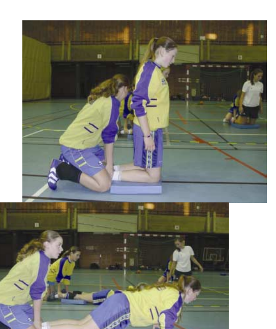
Fig 2 Example of a strength exercise ("Nordic hamstring lowers"). Top: start position; a partner holds around the player's ankles. Bottom: The player falls slowly forwards, using hamstrings to resist the fall against the floor as long as possible

relative risk of the number of injured players according to the intention to treat principle to compare the risk of an injury in the intervention and control groups. Cox regression was our analysis tool for the primary outcome as well as the secondary outcomes, and we used the robust calculation method of the variance-covariance matrix, <sup>16</sup> taking into account the cluster randomisation. We tested rate ratios with Wald's test. We used one way analysis of variance to estimate the intracluster correlation coefficient to obtain estimates of the inflation factor for comparison with planned sample size. We used the inverse of the difference between percentages of injured players in the two groups to calculate the number needed to treat to save one injury. We calculated exposures to training and matches and incidence of injury as described in our earlier study.