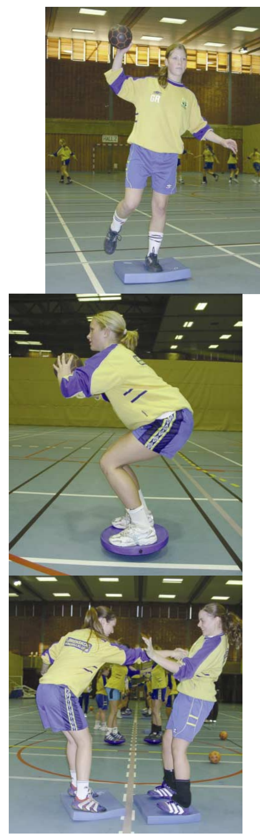
Fig 1 Top: mat exercise. Middle: wobble board exercise. Bottom: mat pair