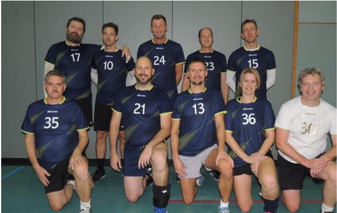
Second: City of Bristol