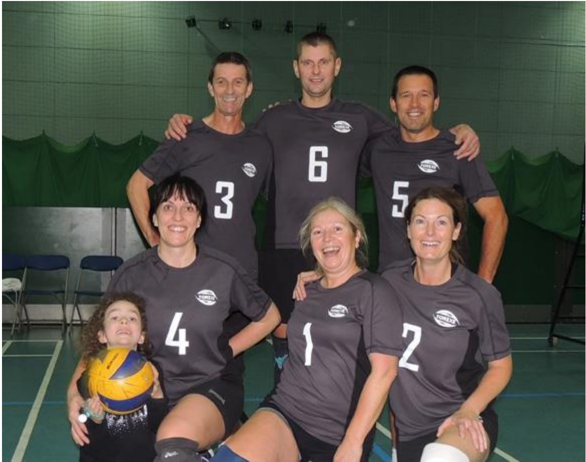
2019 Winners: Torexe Sarga Louts