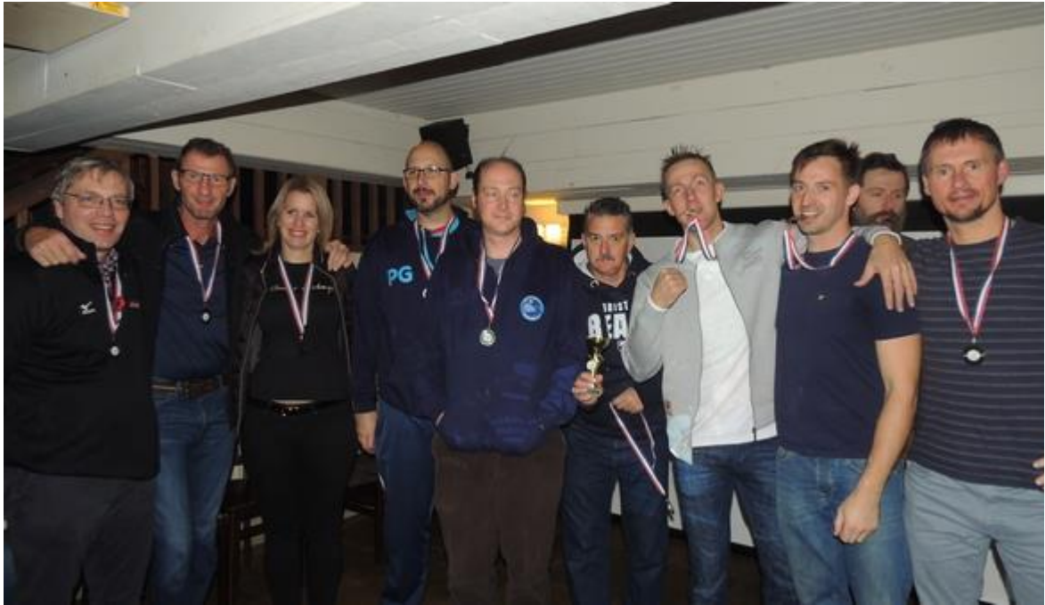
Second: City of Bristol

The SW Vets tournament is a handicap event for our older players where men and women compete against the clock, to either keep their handicap points advantage or to catch and overhaul the other team before the hooter sounds. Teams can be made up of any combination of players and the format generally throws up a different winner each year.