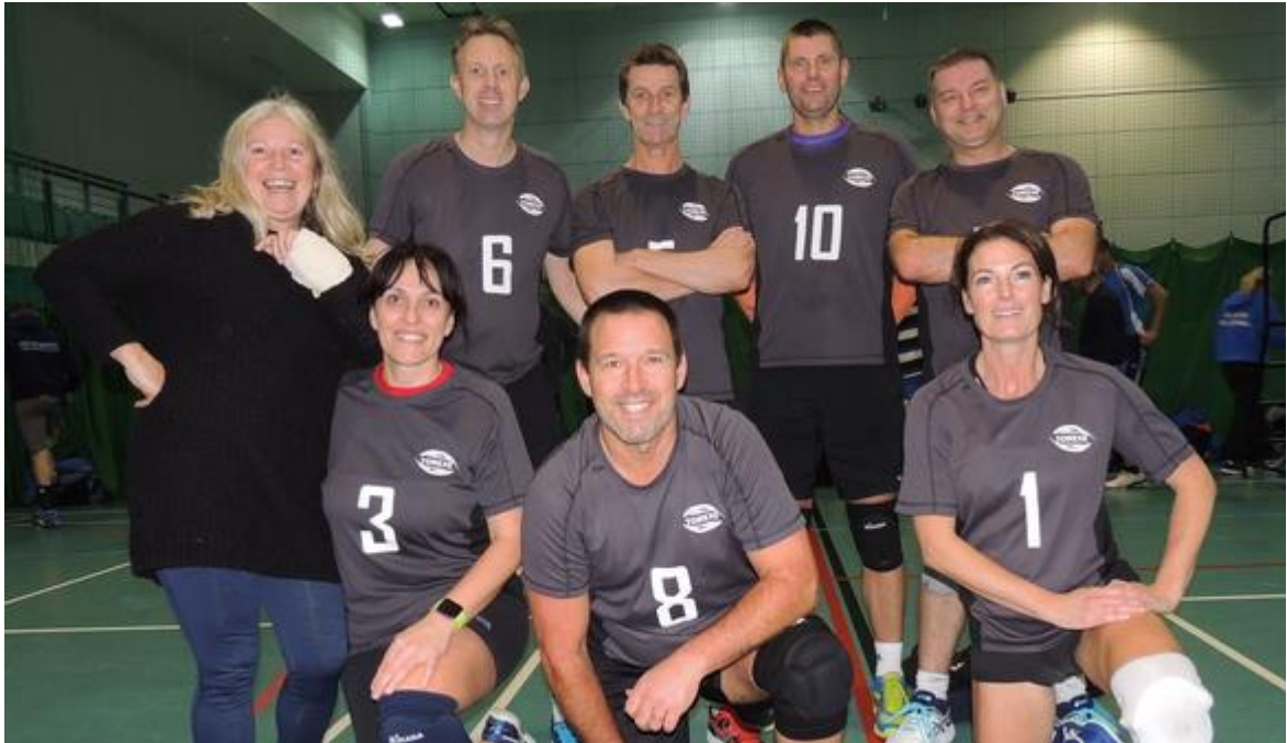
2021 Winners: Torexe Saga Louts

It was great to see a return of tournament action following the 18 month hiatus. The event attracted a lot of interest selling out with 4 teams on the waiting list with 2 months to go, showing that teams were eager to get back. Unfortunately as the date drew nearer a combination of Covid isolations, injury and illness resulted in only 10 teams able to make it on the day.