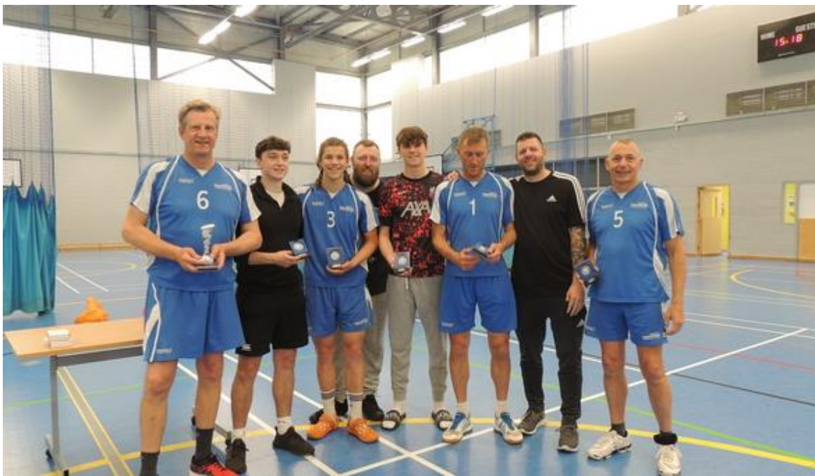
Runners Up: Wiltshire Mavericks