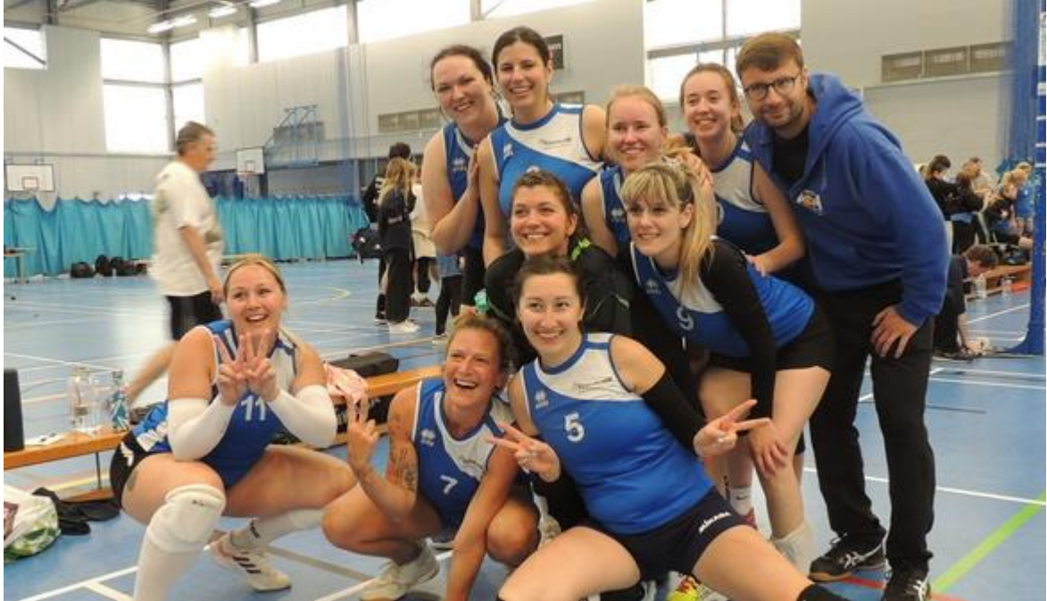
2022 SW Champions: Bristol