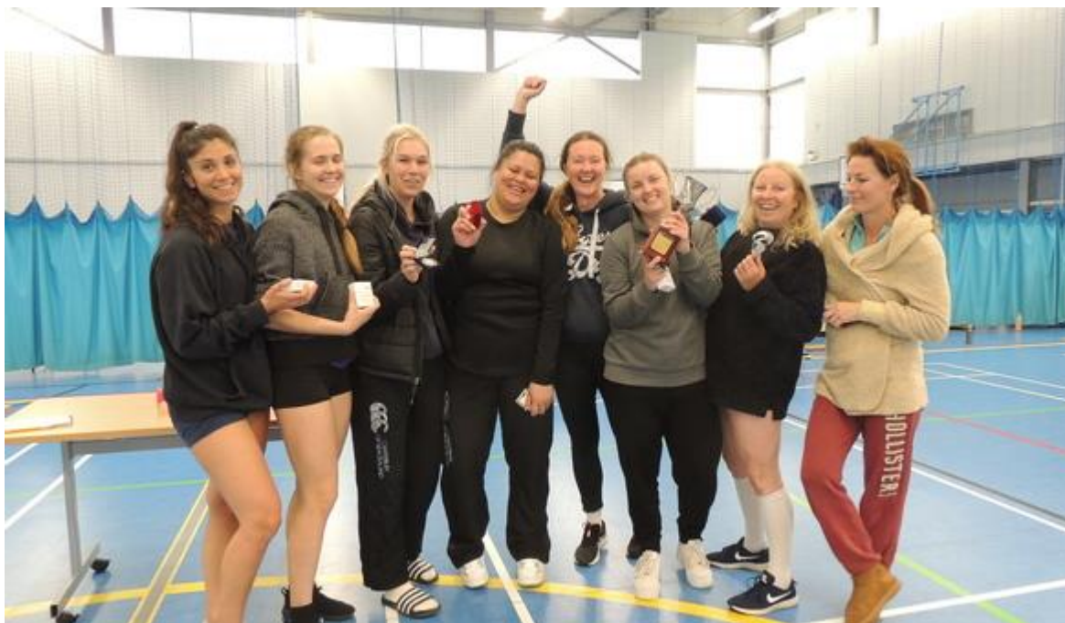
2021/22 SW Ladies League Winner: Torexe Ladies