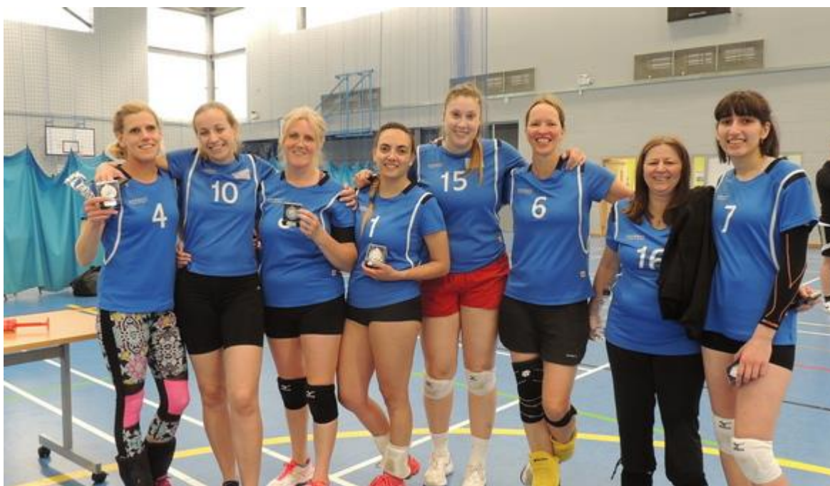
2021/22 SW Ladies League Runners up: Royal Wootton Bassett