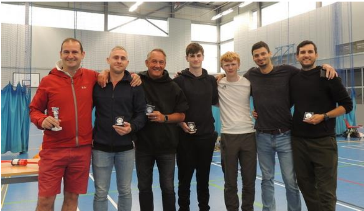
2021/22 SW Men's League Runners up: Cheltenham & Gloucester