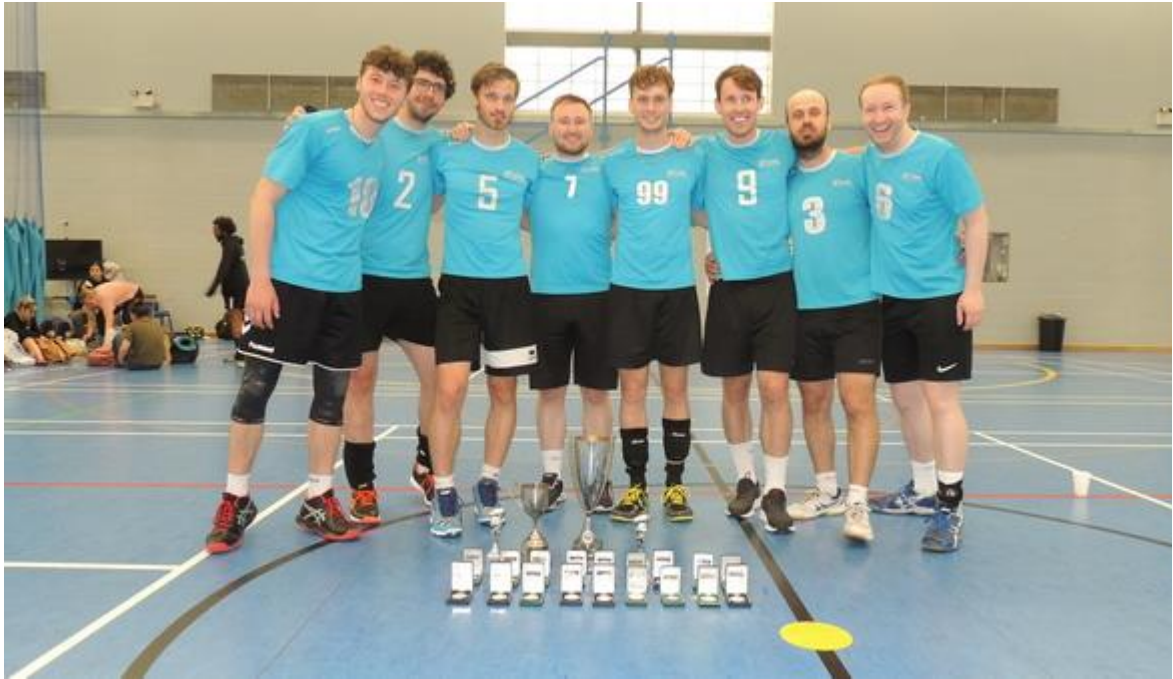
2021/22 SW Men's League Winner: Exeter Storm